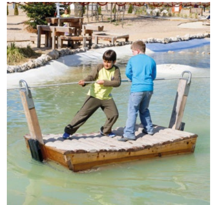
Standard colour of rope red