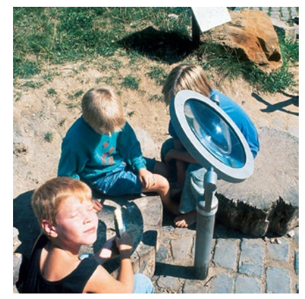
The picture shows the magnifying lens without table.