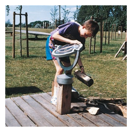
The picture shows the magnifying lens without table.