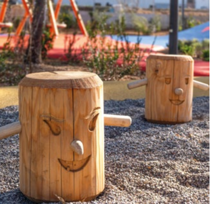
Special version, Order No. 4.24200 Trunk Seat