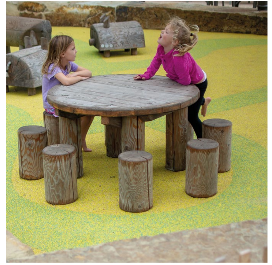
Order No. 4.35050 Toddler's Table with 8 Stools, Photo © Daniel Perales

Play Table Trunk Seat Toddler's Table with 8 Stools