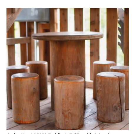
Order No. 4.35050 Toddler's Table with 8 Stools, Table as a special version, Photo © Daniel Perales