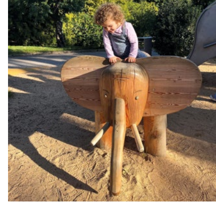
Order No. 4.24173 Baby Elephant