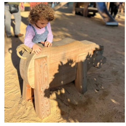
Order No. 4.24176 Rhinoceros