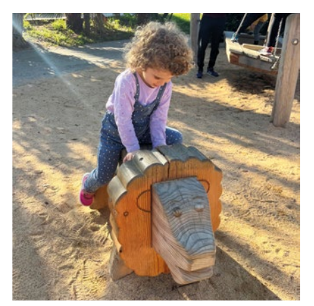
Order No. 4.24175 Lion