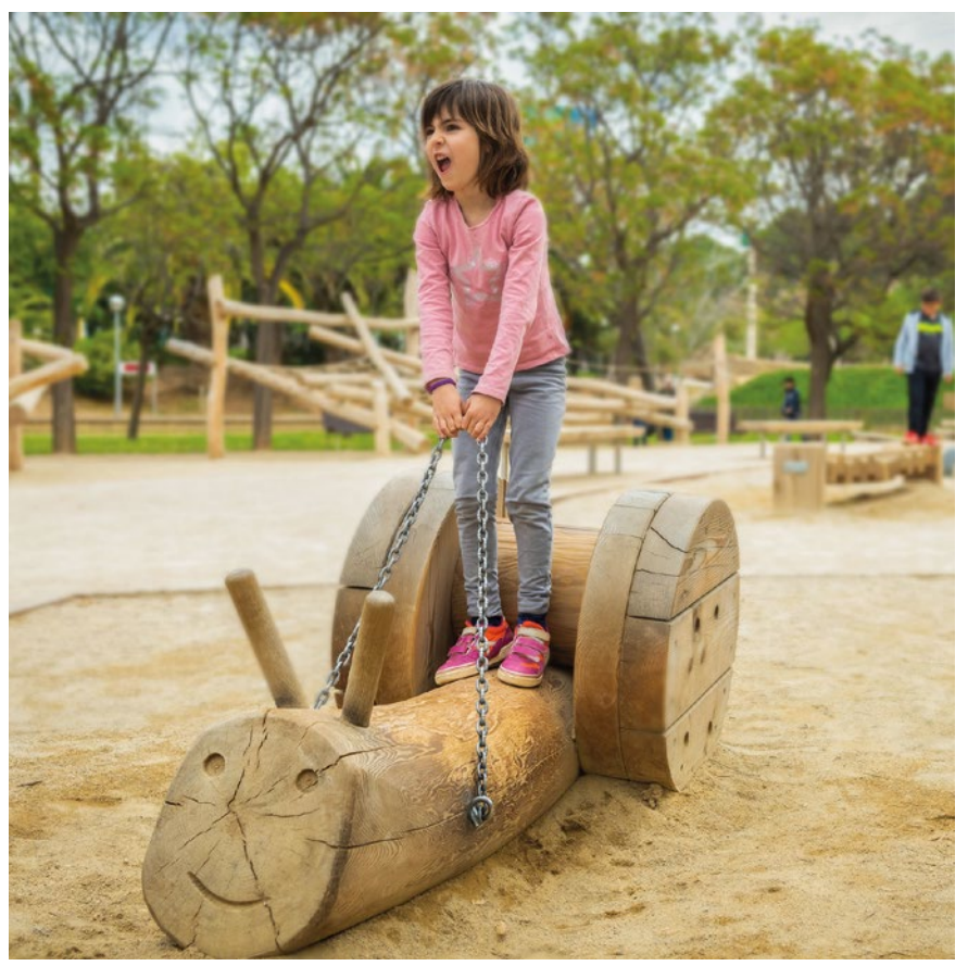
Special version for hot countries