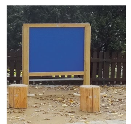
Order No. 4.24450 Drawing Board