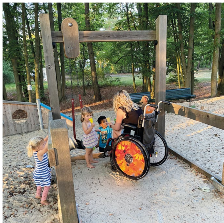
Sand Play Platform for wheelchair users