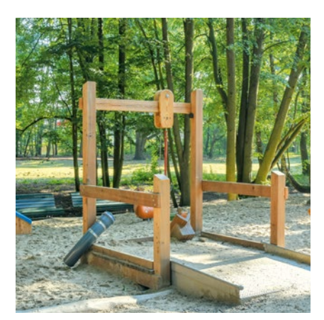
Special version with a longer ramp