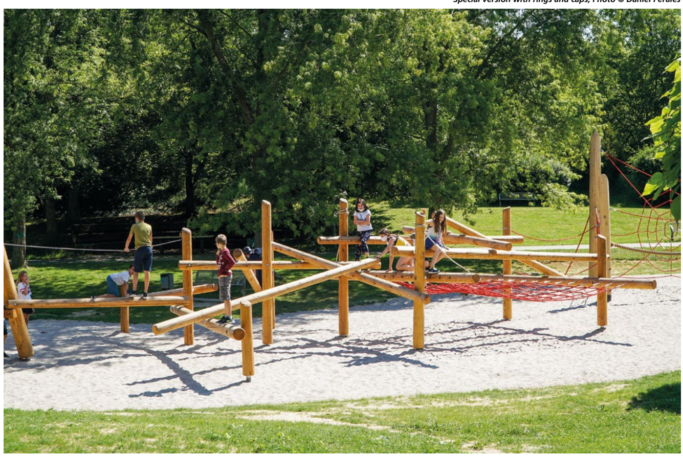
Climbing Structure 06