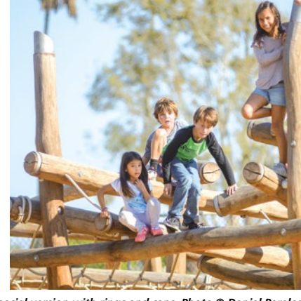
Special version with rings and caps, Photo © Daniel Perales

Climbing Structures made from hand-processed irregular round logs, can be integrated into a strongly nature-oriented environment due to their formal expressive character. Many children can play within a small space; Climbing Structures can even absorb the arrival of a large number of children who wish to play on it and incorporate all of them within a flowing play rhythm. Climbing Structures do not only allow for climbing, experiencing height, and for having a sensual experience with hands and feet, but they can also be used as a nice seat for relaxing and observing.