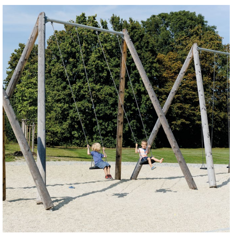
Order No. 7.14020 Extra High Twin Swing special