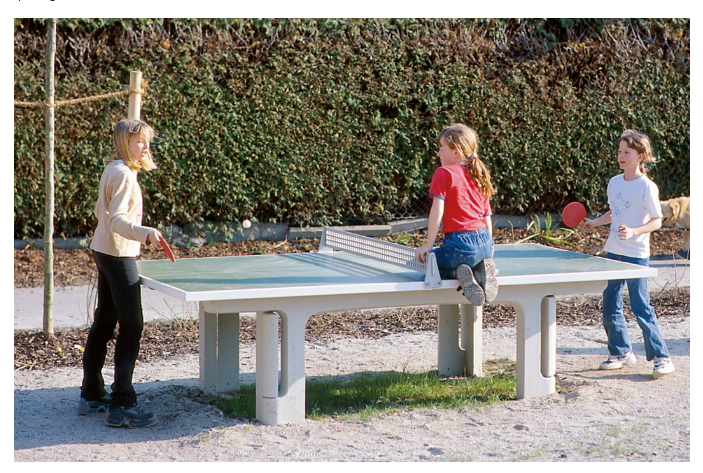
Table Tennis Table

Play value Table Tennis in parks or on playgrounds is often a meeting point for bigger children and adolescents and for this reason should be combined with seating for spectators. Table tennis provides an opportunity for friendly competition, a stimulus for activity ranging from play to sporting conflict.